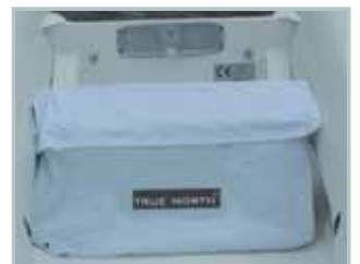
WITH OPTIONAL WOODEN BENCH